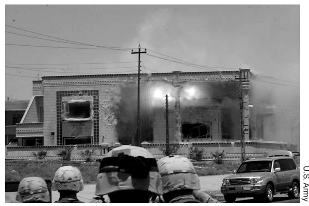
Soldiers assigned to the 101st Airborne Division (Air Assault) look on as a tube-launched optically-tracked wire-guided (TOW) missile penetrates a building where Uday and Qusay Hussein, the sons of Saddam Hussein, barricaded themselves.

adversary while attempting to provide security to the civilian population, it must also avoid furthering the insurgents' cause. If, for example, the military's actions in killing 50 guerrillas cause 200 previously uncommitted citizens to join the insurgent cause, the use of force will have been counterproductive."<sup>7</sup>