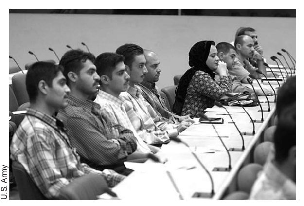
Conference of the Entrepreneur Business Professionals of Iraq hosted by the 354th Civil Affairs Brigade on 20 September 2003. More than 200 young business professionals between the ages of 21 and 35 participated in lectures and working groups on topics related to creating and managing businesses in a global economy.

So-called "CERP" (Commander's Emergency Reconstruction Program) funds—funds created by the Coalition Provisional Authority with captured Iraqi money in response to requests from units for funds that could be put to use quickly and with minimal red tape—proved very important in Iraq in the late spring and summer of 2003. These funds enabled units on the ground