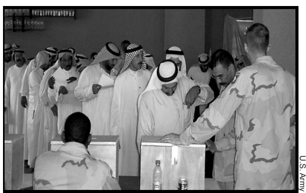
"Success means acting across the full spectrum of operations." U.S. military assists in local Iraqi election.

groupings—and their respective viewpoints; the relationships among the various groups; governmental structures and processes; local and regional history; and, of course, local and national leaders. Understanding of such cultural aspects is essential if one is to help the people build stable political, social, and economic institutions. Indeed, this is as