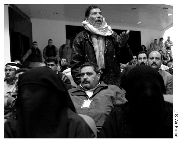
During a recognition ceremony held in the Baghdad Convention Center on 9 January 2004, an Iraqi working for the Civil Defense Corps petitions the Coalition for compensation for all the wounded Iraqis and widows.

Army's 9th Division (Mechanized), based north of Baghdad at Taji, and the 8th Division, which has units in 5 provinces south of Baghdad) and police academies (such as the one in Hillah, run completely by Iraqis for well over 6 months). Indeed, our ability to assist rather than do has evolved considerably since the transition of sovereignty at the end of late June 2004 and even more so since the elections of 30 January 2005. I do not, to be sure, want to downplay in the least the amount of work still to be done or the daunting challenges that lie ahead; rather, I simply want to emphasize the importance of empowering, enabling, and assisting the Iraqis, an approach that figures prominently in our strategy in that country.